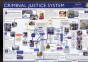
CJS AWARENESS POSTER