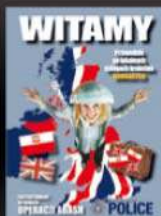
POLISH GUIDE BOOK