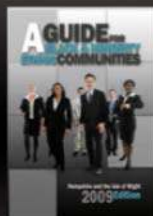
BME GUIDE BOOK