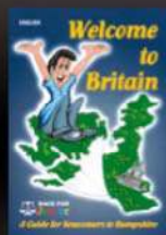
NEWCOMER GUIDE BOOK