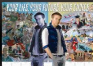
YOUTH CRIME POSTER